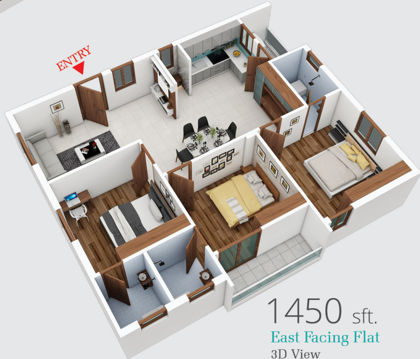
1450 sft. East Facing Flat 3D View