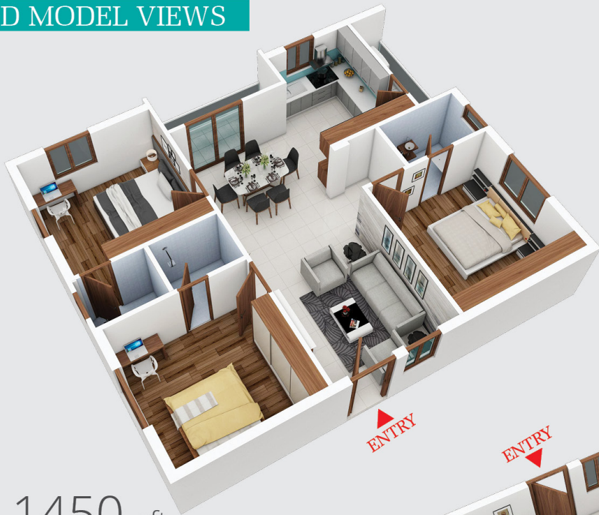
1450 sft. West Facing Flat 3D View